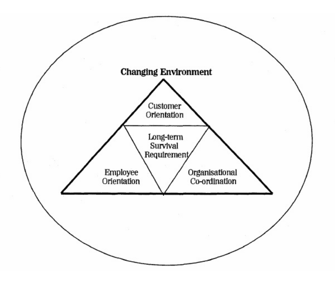
Figure 2: The conceptual framework of marketing orientation in an FE context